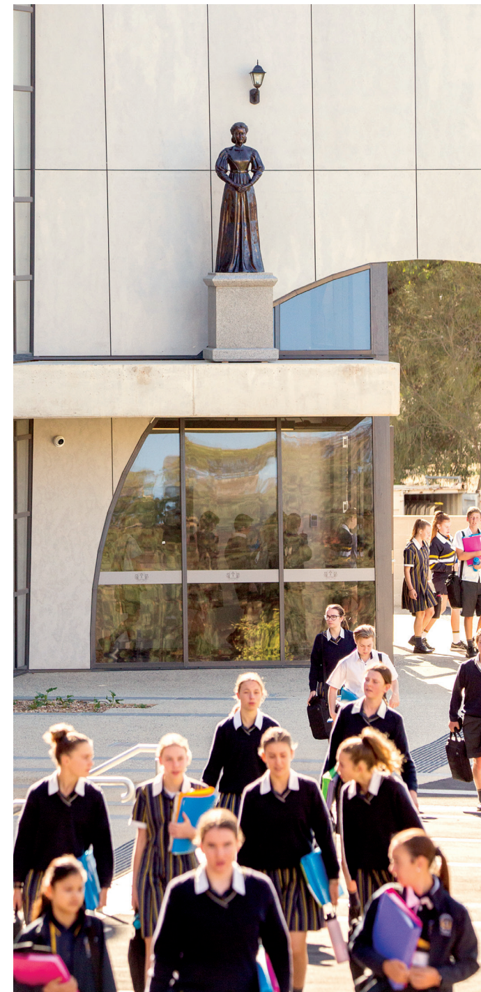
Life-size bronze statue of Catherine McAuley located at the Cooklock Campus of Catherine McAuley College, Bendigo, Victoria.