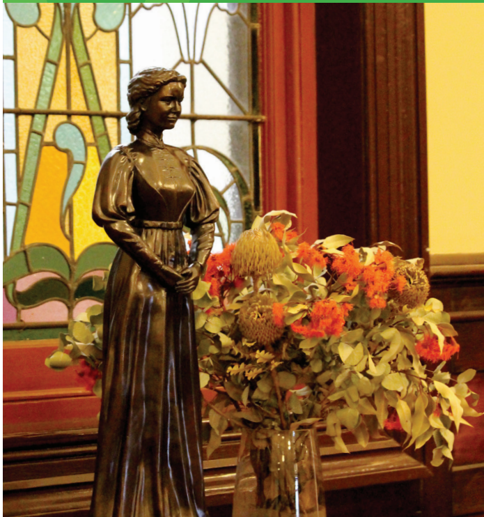
Reception size bronze statue of Catherine McAuley, located in South Melbourne, Victoria.

This beautiful statue was designed to signal to all who enter a place of Mercy, that we are inspired by Catherine's values and the charism of Mercy in all that we do.