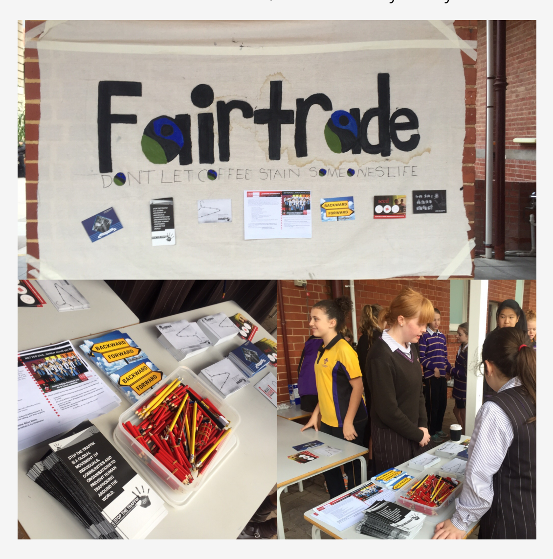
Switched On Schools Summit

Do you know where your hot coffee, hot chocolate or tea comes from? What about your clothes? From May 8-22, Saint Aloysius College recognised Fair Trade Fortnight. During Justice and Mercy Group sessions, students learnt about the benefits of supporting fair trade products and how in many industries, workers at the bottom of the supply-chain are being poorly treated. To raise awareness for fair trade and money for ACRATH (Australian Catholic Religious Against Trafficking in Humans), JAM leaders hosted a hot drinks stall on Wednesday and Thursday in Week 2. As people purchased their morning cuppa, they were encouraged to partake in a postcard campaign, asking brands such as Seed clothing to review their supply chain policies and make them transparent. The students enjoyed sharing their learnings and their passion with staff, students, parents and friends and raised more than $180.00 for a very worthy cause.